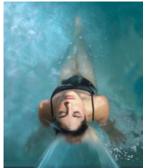
The Fairmont Empress, Victoria, BC

The Willow Stream name and logo were designed to reflect our story.