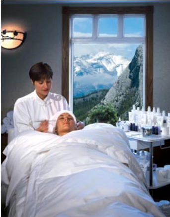
The Fairmont Banff Springs, Alberta

The spa experience ultimately relies on the person creating it. We embrace positive energy and balance in our lives so that we can care for you, as we care for ourselves. Our personal health and energy will further inspire you. Most important, we enjoy meeting new people and sharing our energy. Feel the difference in our treatments.