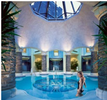
The Fairmont Banff Springs, Alberta

The result is experiences that awaken our senses, pique our joy and quench our thirst for energy.